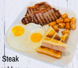
Ny Steak with Hashbrown