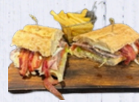
Pan con Lomito del Diego