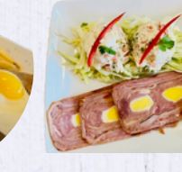
Matambre with Rusa