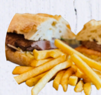
Pan con Lomito