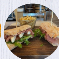
Prosciutto del Gaucho