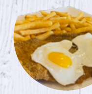
Milanesa a Caballo