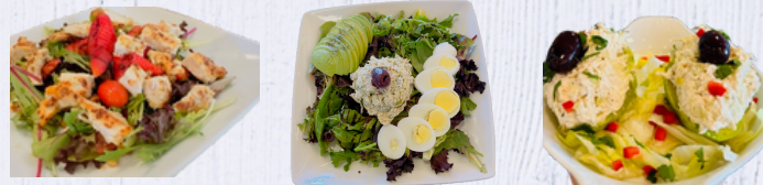
Chicken Strawberry Chicken Salad Palta Rellena Avo Chicken

Chimichurri : Extra virgen olive oil, Aji Triturado, parsley