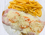
Milanesa a la Napolitana