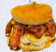
Del Gaucho Burger

Morrone s Ham, cheese, red Peppers 14.99