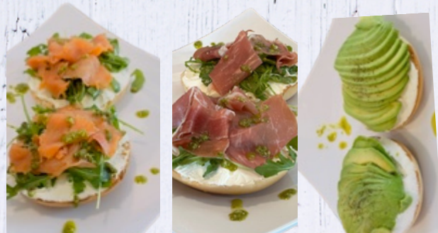
Salmon Bagel Prosciutto Bagel Avocado Bagel